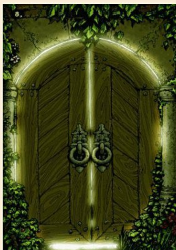
WHAT LIES BEYOND THE MAGIC "ELEVEN" GATEWAY?