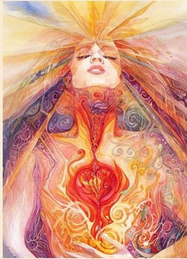
Archangel Jophiel

The Soul Number for "October" is Number 17 which reduces to the Number Eight. Seventeen is the number of the Divine Channel which, when accessed, offers us revelations of Truth. It is also a number associated with Archangel Jophiel, the angel who assists us in keeping our thoughts beautiful and positive. Eight is the number of tests and mastery when we are in balanced alignment with both the material and spiritual realms.